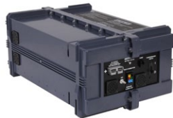
URB0001 - MKM