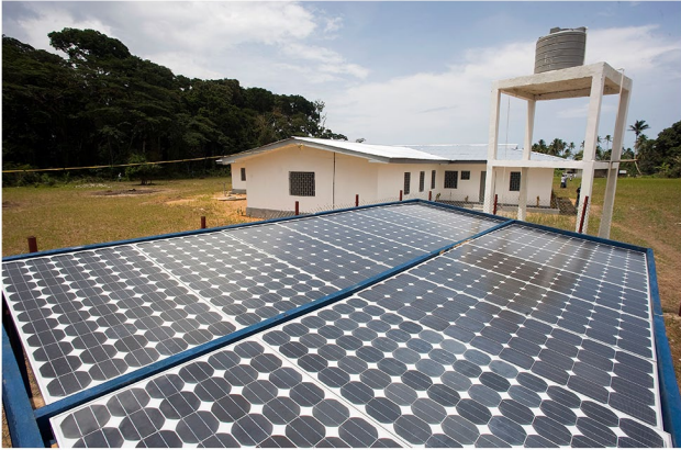
Ultralife's Li-Ion storage solutions provide much lower total cost of ownership.

Traditional battery chemistries such as Sealed Lead Acid (SLA) are heavy, costly to maintain and take up more space than Lithium Ion batteries. When you also factor in the logistics and labor to replace SLA every 1-2 years, Lithium Ion becomes the clear choice. Ultralife's Lithium Ion products can be an affordable solution to these and many other issues, especially in remote locations, while providing a much lower "total cost of ownership" solution over SLA.